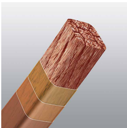
RUPALIT® Safety Profile

Operating voltage: max. 1000 Vrms max. 1410 Vpeak