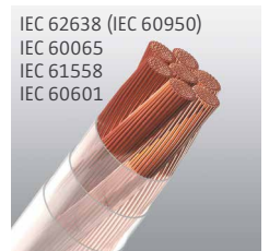
with foil – min. 66% overlap

IEC 62638 (IEC 60950) IEC 60065 IEC 61558 IEC 60601