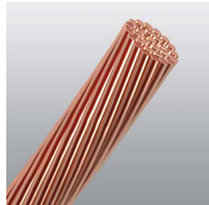
Enamelled copper wire (Magnet wire)