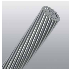
Enamelled aluminium wire